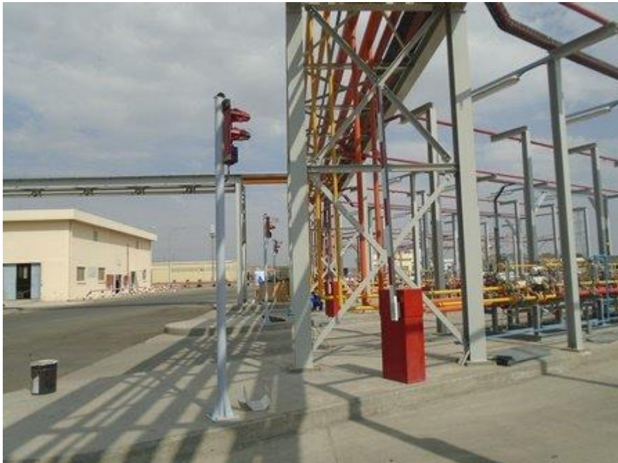
FIGURE 1 TO 3 – IMAGES FROM TAIF INSTALLATION.